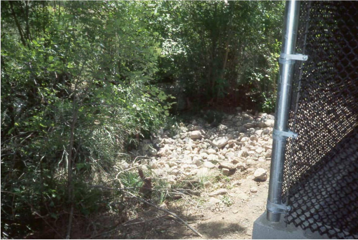
Bass House Springs , cinderblock foundation and riprap inundate the springhead and hold water back from flowing into the Page Springs watercourse (note gap in understory where water previously flowed).